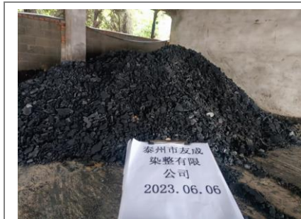
I003) Sampling location surrounding