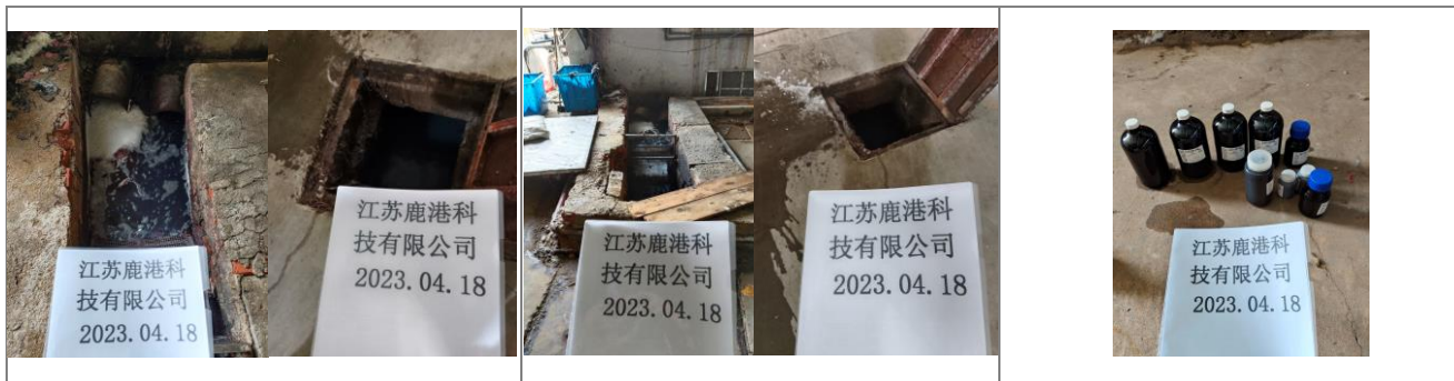
I001) Sample for phthalate test