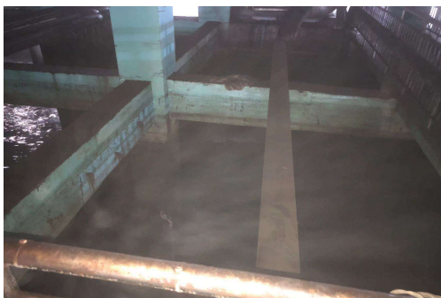
Photo of before treatment area