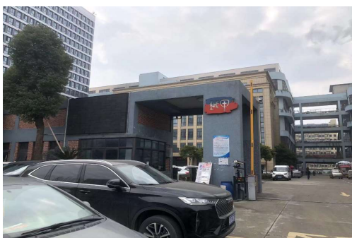
Photo of facility gate

Testing period: From 03 Jan, 2023 PM to 10 Jan, 2023 Testing period Subcontracted Lab (if applicable): Not Applicable