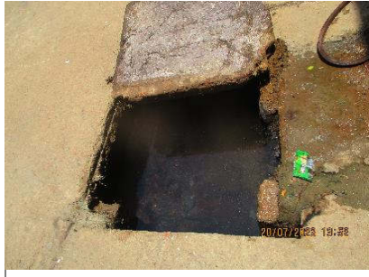
I001) Sampling location surrounding

Latitude: 24.379636; Longitude: 90.378625