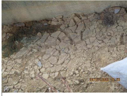
I003) Sampling location surrounding

Latitude: 24.379636; Longitude: 90.378625