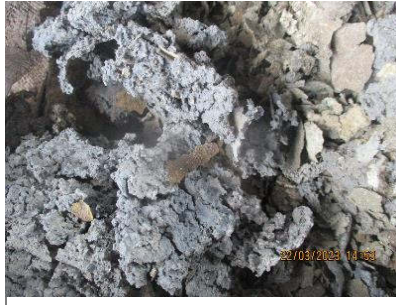
I003) Sampling location surrounding

GPS Location: N 24° 25' 30"; E 90° 32' 30.12"