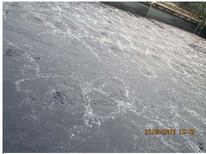
I001) Sampling location surrounding

GPS Location: N 24° 25' 30"; E 90° 32' 30.12"