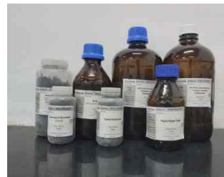
Sample - Sludge