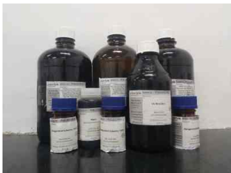
Sample - Untreated wastewater