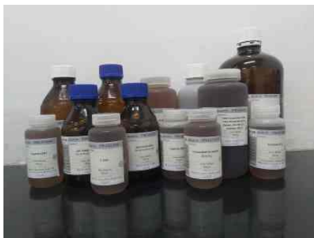
Sample - Effluent