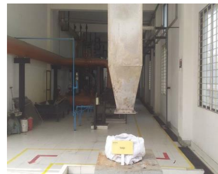
Sampling point - Sludge