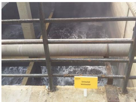
Sampling point - Untreated wastewater