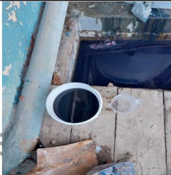
SAMPLING LOCATION, CLOSE-UP VIEW