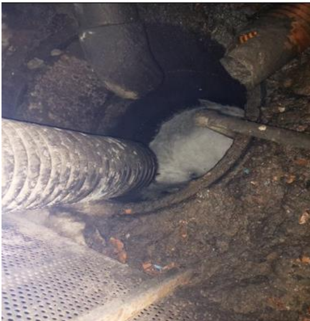
SAMPLING LOCATION, CLOSE-UP VIEW