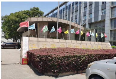
Photo of facility gate