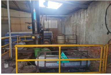
Photo of wastewater before treatment area