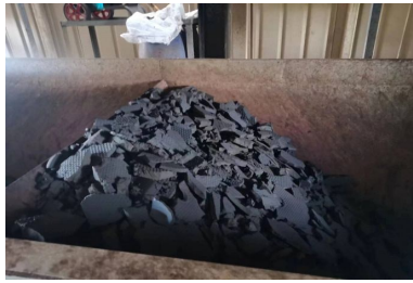
Photo of Sludge Sampling Point