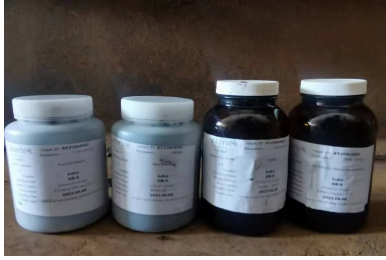
Photo of sludge sample