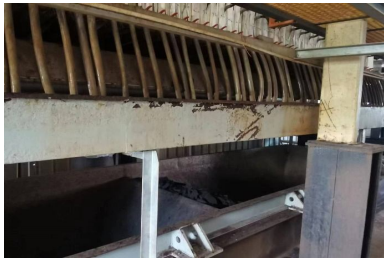
Photo of Sludge Area