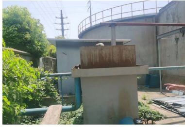
Photo of wastewater after treatment area