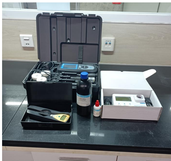
Field Testing Instruments

GPS for this point (if available); Latitude: 23.97056°, Longitude: 90.29836166666668°