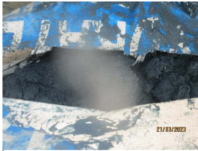
I003) Sampling location surrounding