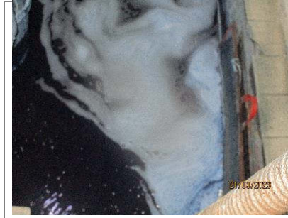
I001) Sampling location surrounding