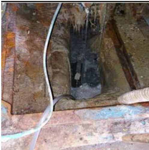
SAMPLING LOCATION, CLOSE-UP VIEW