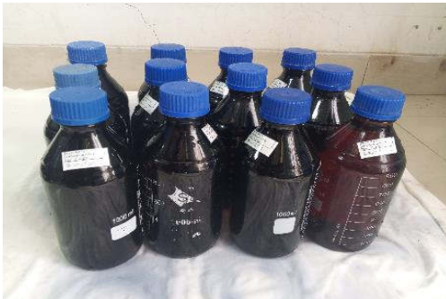
Labelled sample bottles 17/10/2024