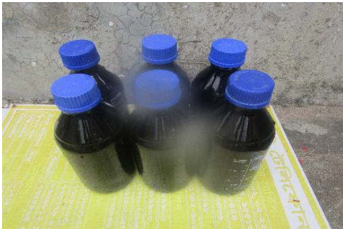
Labelled sample bottles 17/10/2024