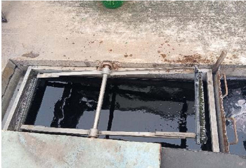
Sampling point 17/10/2024