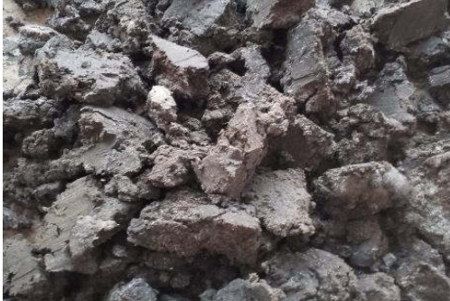
Sampling point 17/10/2024