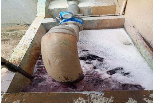
Sampling point 17/10/2024