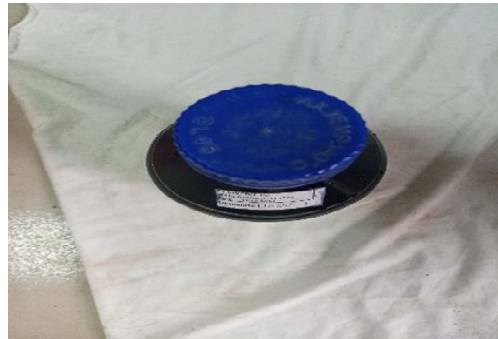
Sample for phthalate test 17/10/2024