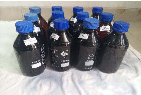
Labelled sample bottles 17/10/2024