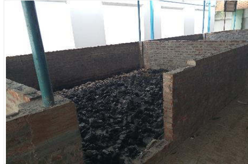
Sampling point surrounding environment 17/10/2024