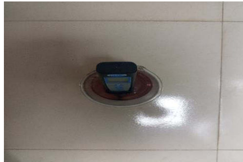
pH measurement 17/10/2024