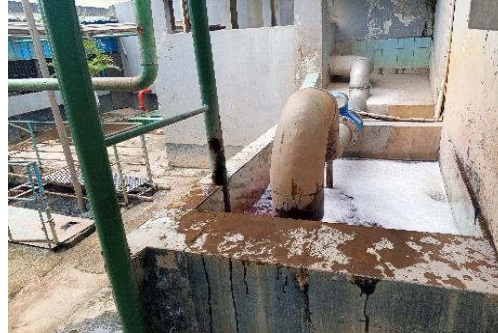
Sampling point surrounding environment 17/10/2024