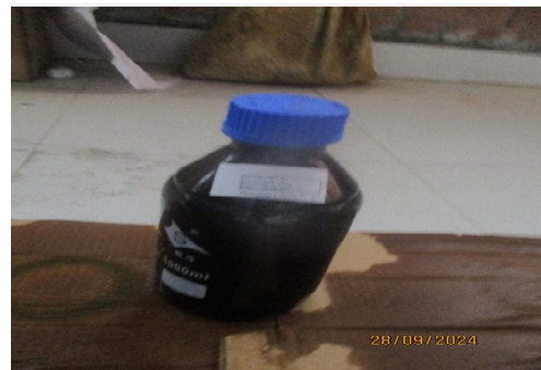
Sample for phthalate test 28/09/2024; 17:41