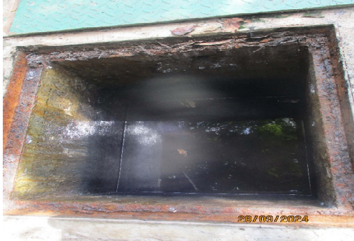
Sampling point 28/09/2024; 11:06