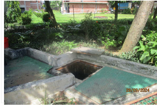
Sampling point surrounding environment 28/09/2024; 11:08