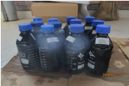
Labelled sample bottles 28/09/2024; 17:42