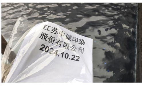
Sampling point 22/10/2024, 10:20