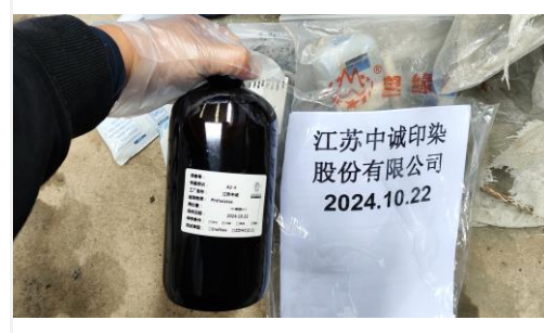
Sample for phthalate test 22/10/2024, 10:20