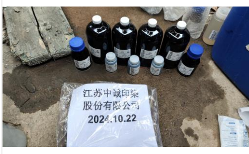
Labelled sample bottles 22/10/2024, 10:20