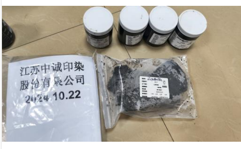
Labelled sample bottles 22/10/2024, 10:10