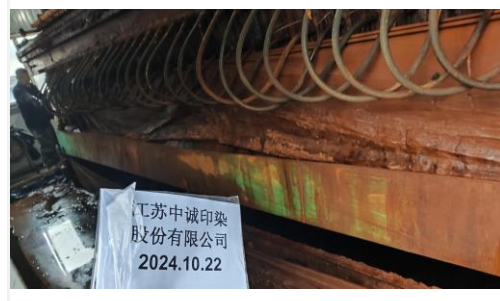
Sampling point surrounding environment 22/10/2024, 10:10