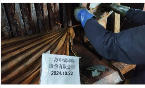
Sampling point 22/10/2024, 10:10