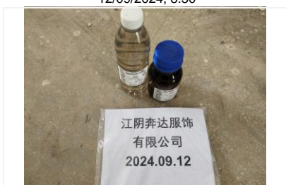
Labelled sample bottles 12/09/2024, 8:30