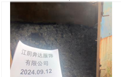
Sampling point 12/09/2024, 8:55