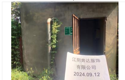
Sampling point surrounding environment 12/09/2024, 8:30