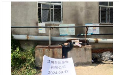
Sampling point surrounding environment 12/09/2024, 8:35