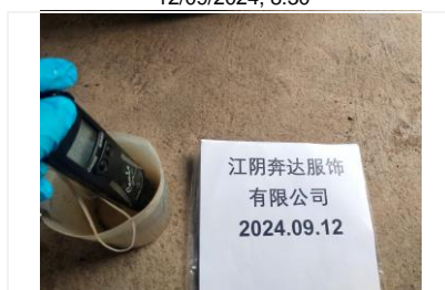
pH measurement 12/09/2024, 8:30