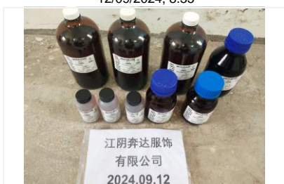
Labelled sample bottles 12/09/2024, 8:35