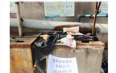
Sampling point 12/09/2024, 8:35