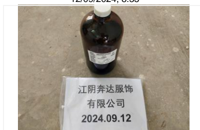
Sample for phthalate test 12/09/2024, 8:35