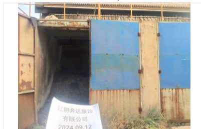
Sampling point surrounding environment 12/09/2024, 8:55