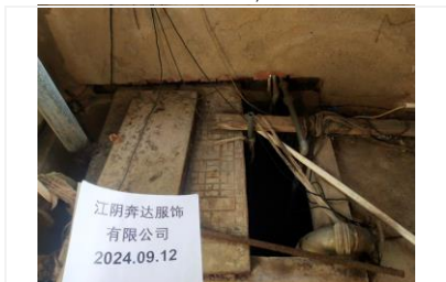
Sampling point 12/09/2024, 8:30