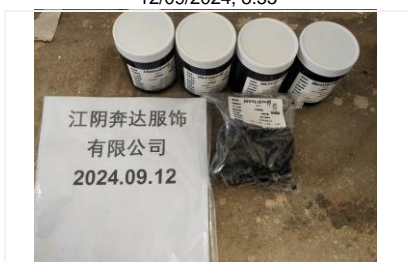
Labelled sample bottles 12/09/2024, 8:55