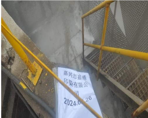
Sample 1 – Labelled Sample Bottles