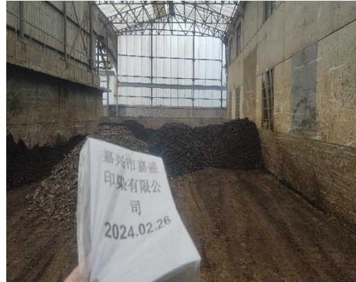
Sample 3 – Sample Packaging N 30° 48' 45. 11", E 120° 42.34. 13"