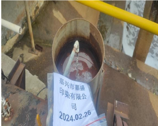
Sample 2 – Labelled Sample Bottles N 30° 48' 46. 31", E 120° 42.48. 21"