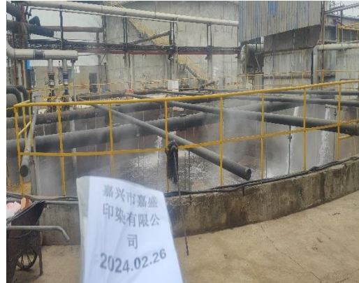
Sample 1 – Sample for Phthalate Test