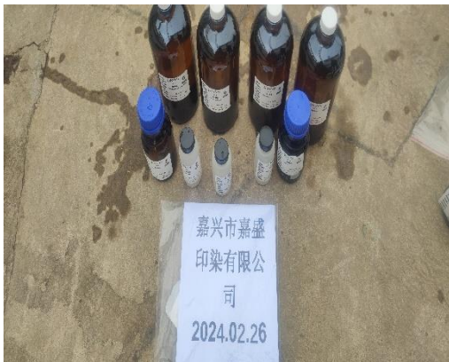
Sample 1 – Sample Packaging