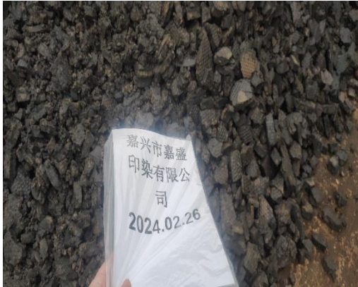
Sample 3 – Labelled Sample Bottles N 30° 48' 45. 11", E 120° 42.34. 13"