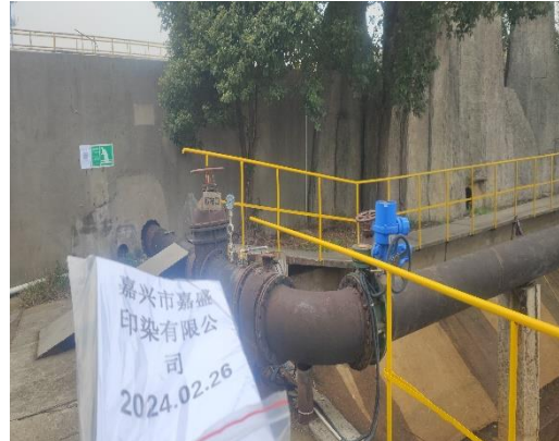
Sample 2 – pH Measurement N 30° 48' 46. 31", E 120° 42.48. 21"