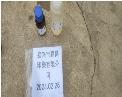
Sample 2 – Sample Packaging N 30° 48' 46. 31", E 120° 42.48. 21"