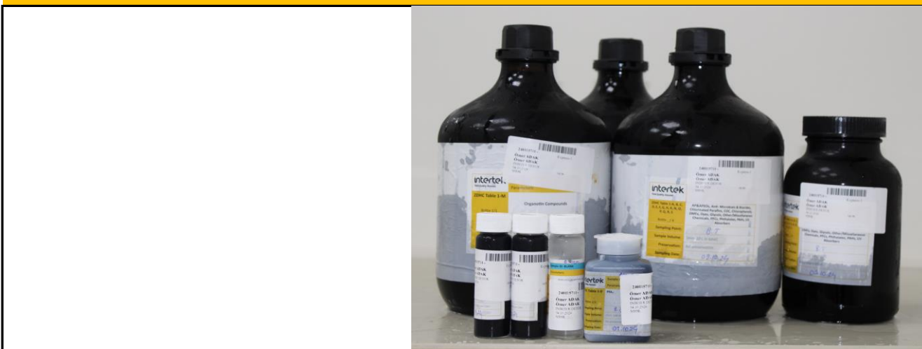
Photo of untreated wastewater