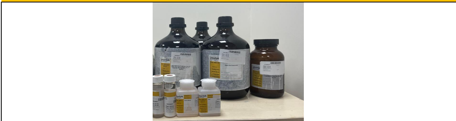
Photo of untreated wastewater