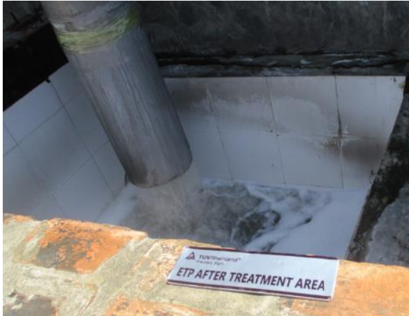
Photo of the Sample/Sampling Location M001- ETP outlet water (After Treatment)