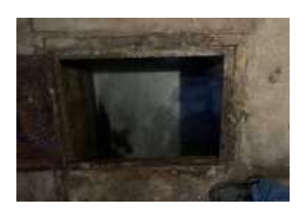
Photo of sampling point of yarn dyeing workshop (before treatment)

Photo of sampling point (after treatment)