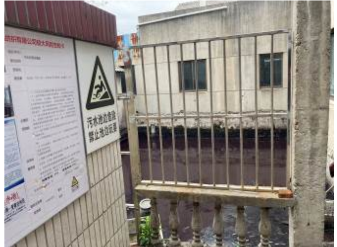
Photo of Before Treatment Area