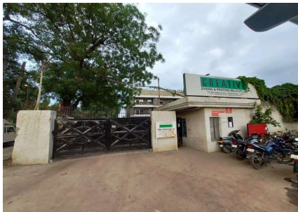
Photo of facility gate

Testing period: From 18-09-2021 to 25-09-2021