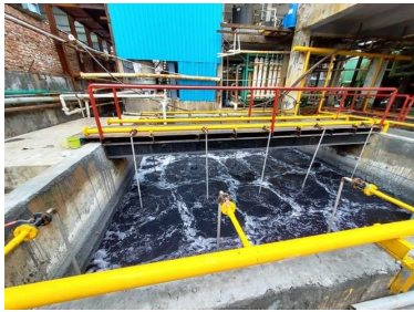
Photo of before treatment area