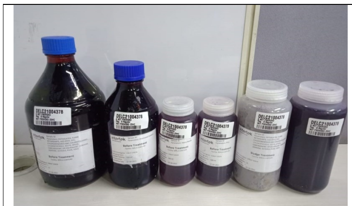
Digital of Sample Raw wastewater & Sludge