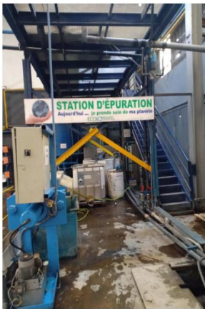
Photo of before treatment area