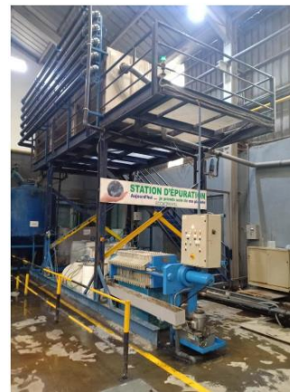
Photo of after treatment area