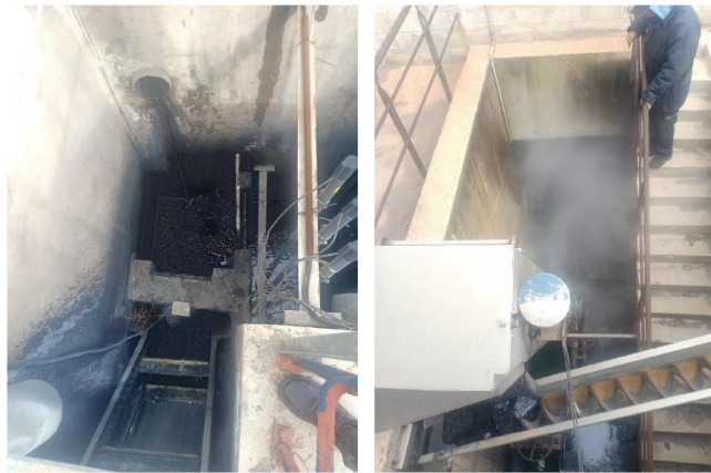
Photo of before treatment area