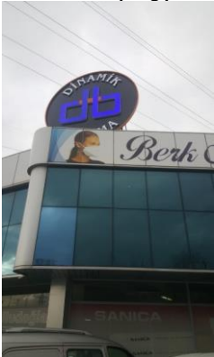
Photo of facility gate

Testing period: 25/11/2021 to 03/12/2021