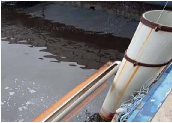
I001) Sampling Point N/S 40° 53' 38.40" E/W 29° 13' 47.87"