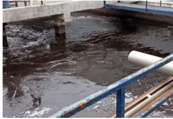
I001) Sampling Point Surrounding Environment N/S 40° 53' 38.40" E/W 29° 13' 47.87"