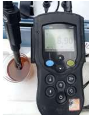
I001) pH value