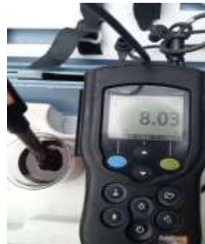
I002) pH value