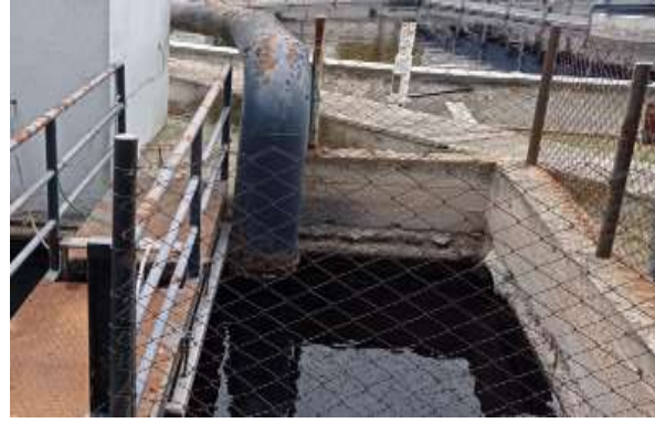
I002) Sampling Point Surrounding Environment N/S 40° 53' 38.40" E/W 29° 13' 47.87"