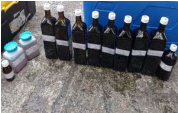
I002) All sampled bottles with label