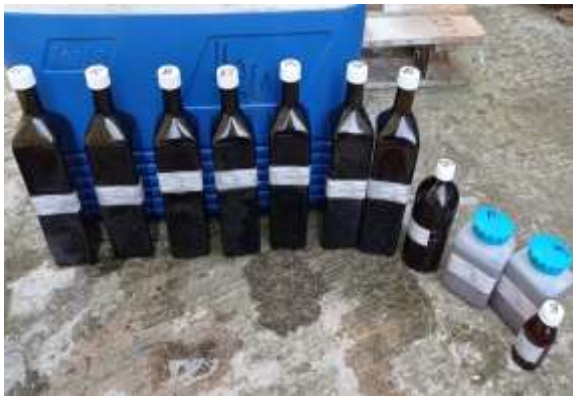
I001) All sampled bottles with label