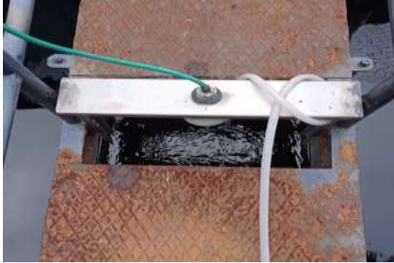
I002) Sampling Point N/S 40° 53' 38.40" E/W 29° 13' 47.87"