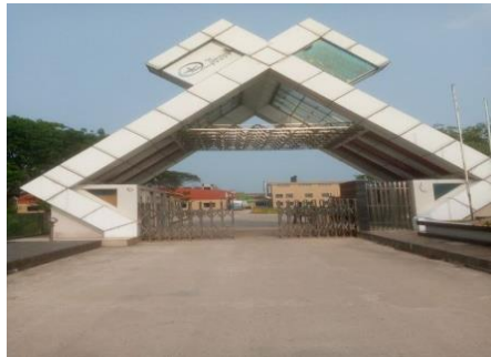
Photo of facility gate

Testing period: From 21-04-2022 to 27-04-2022