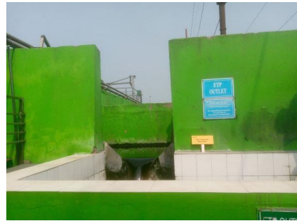
Photo of after treatment area