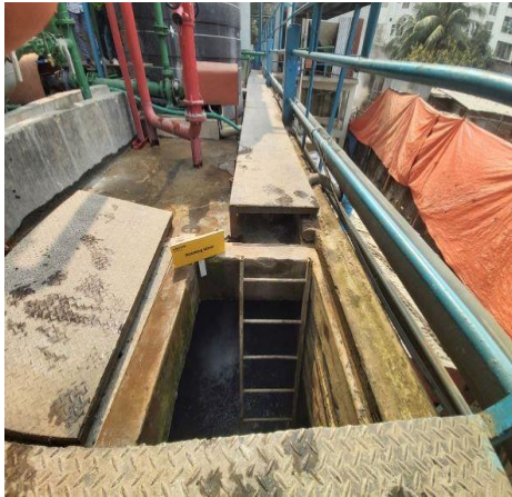
Sampling point - Incoming Water