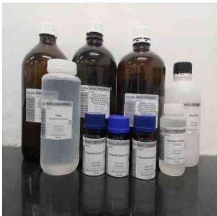
Sample- Incoming Water