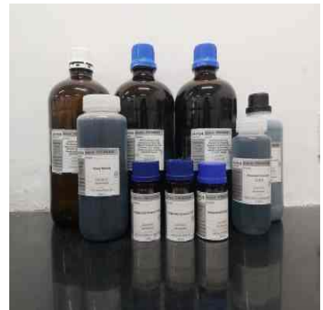
Sample- Raw Wastewater