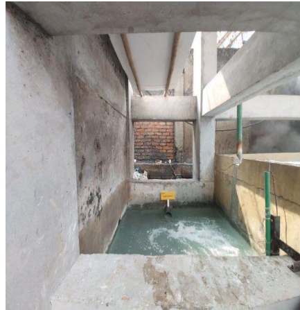
Sampling point-Wastewater (Treated)