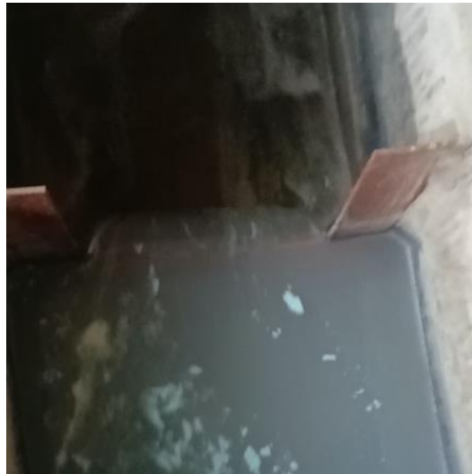
Foam Picture at 3.53pm, 10 Feb. 2022

GPS for this point (if available); Latitude: 23.948049 0 , Longitude: 90.270940 0