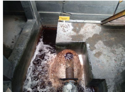
Photo of after treatment area