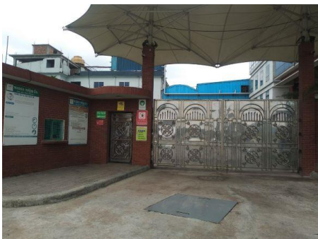
Photo of facility gate

Testing period: From 14-05-2022 to 22-05-2022