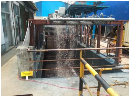
Photo of before treatment area