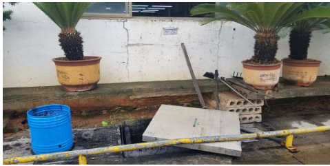
Photo of before treatment area