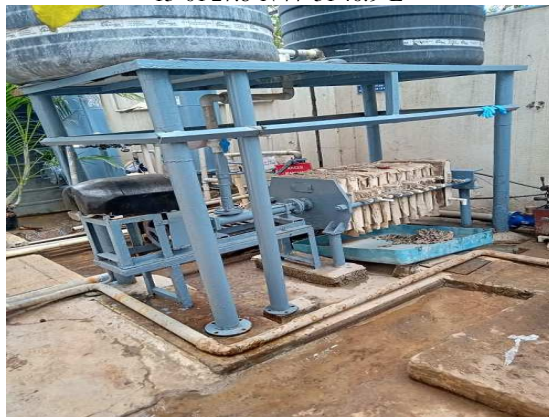
I002) Sampling Point Surrounding Environment 13°01'27.8"N 77°31'40.9"E