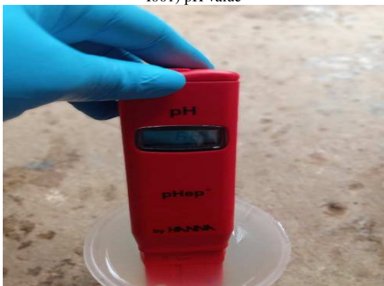
I001) pH value