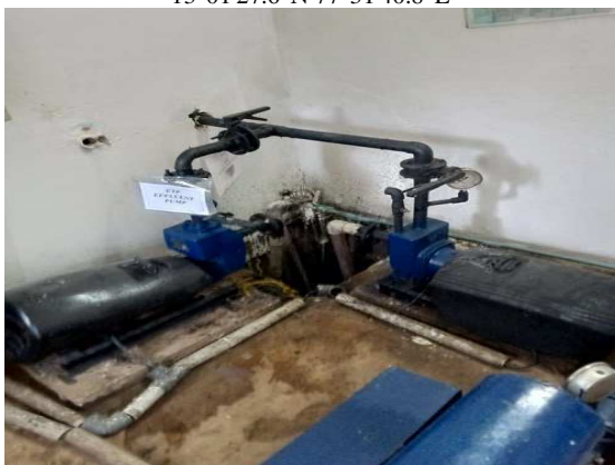
I001) Sampling Point Surrounding Environment 13°01'27.6"N 77°31'40.8"E