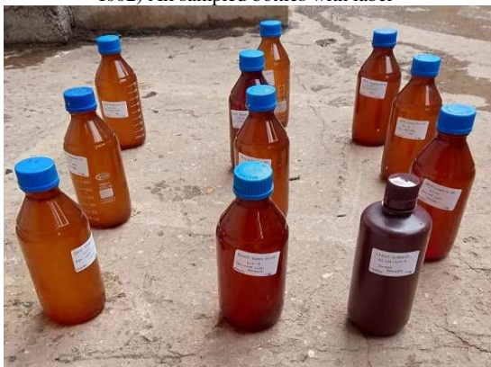
I002) All sampled bottles with label