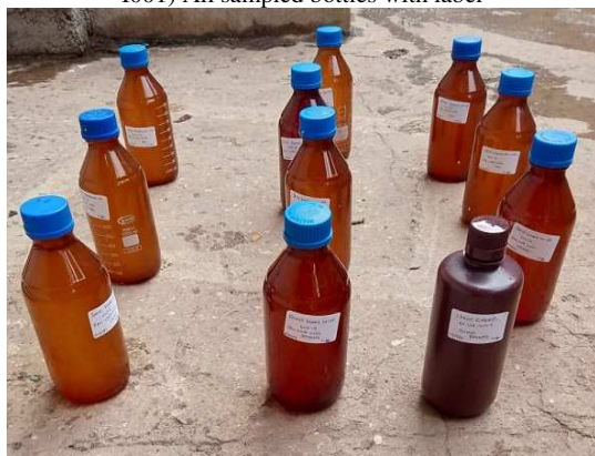
I001) All sampled bottles with label