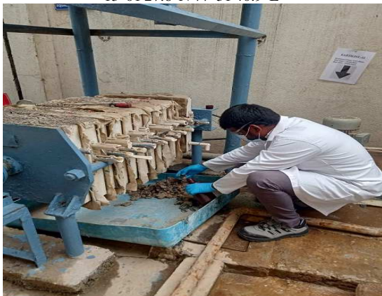
I002) Sampling Point 13°01'27.8"N 77°31'40.9"E