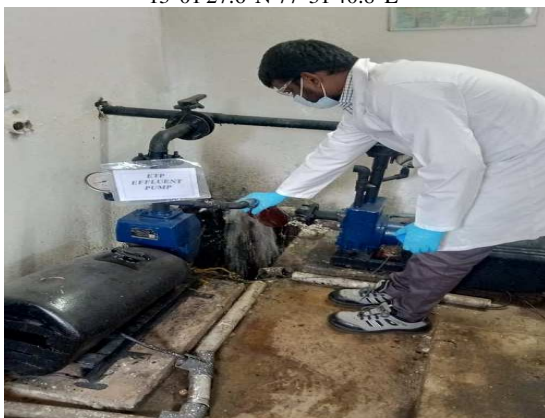
I001) Sampling Point 13°01'27.6"N 77°31'40.8"E