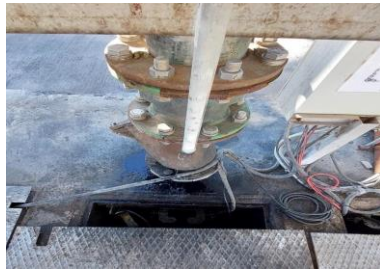
Photo of before treatment area