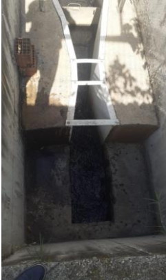
Photo of after treatment area